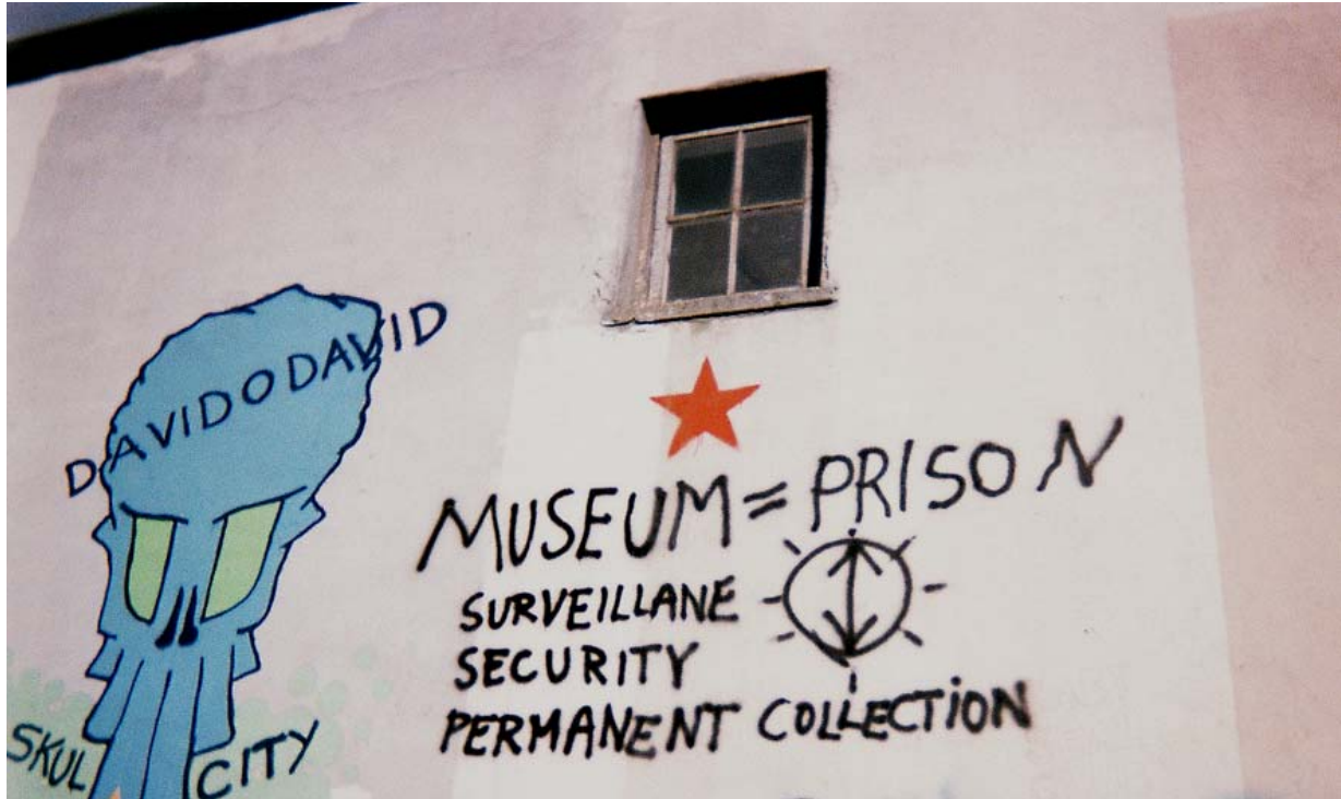
Graffiti on the wall of a gallery in Toronto