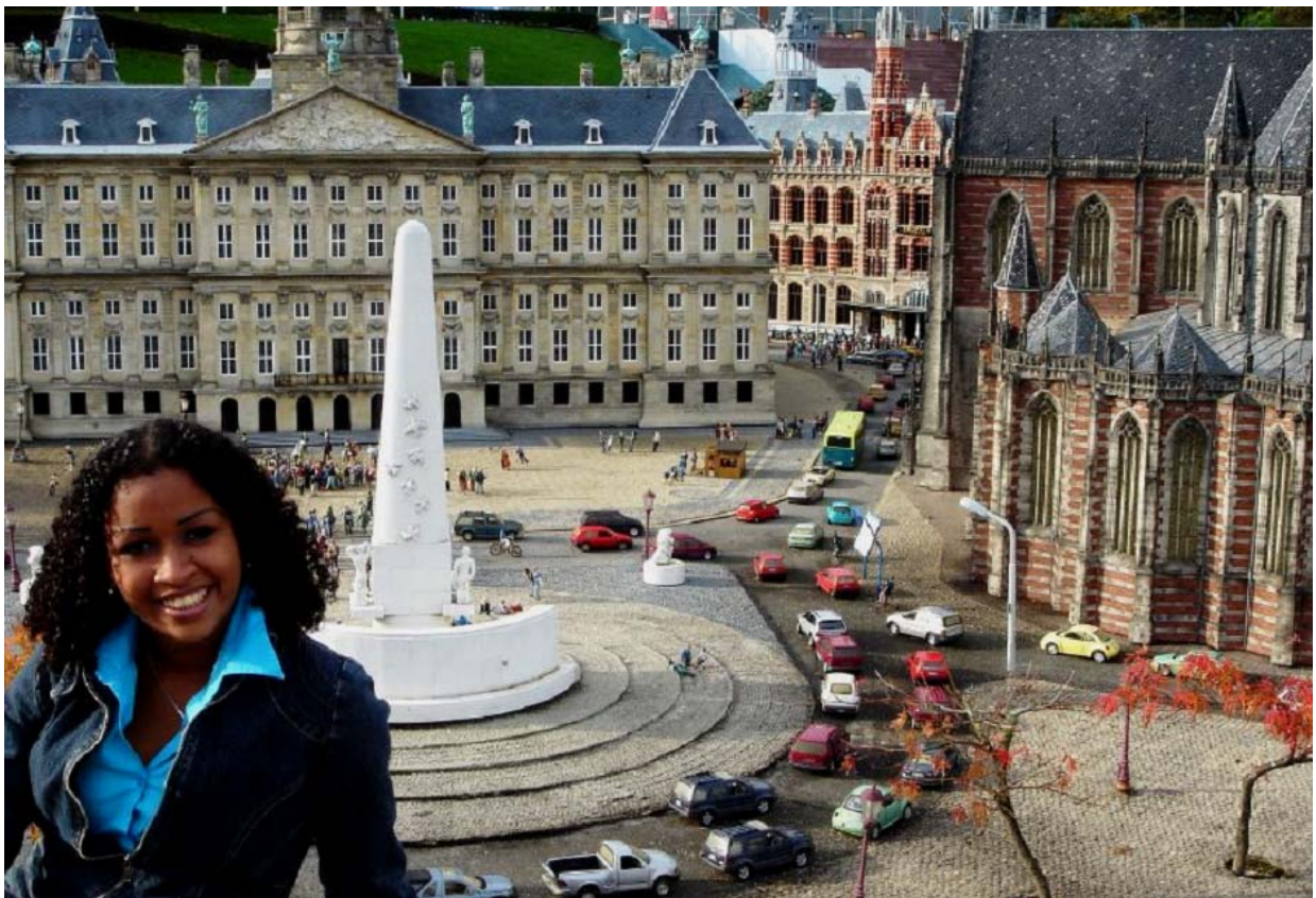
Young woman in front of a scale model of Amsterdam in the miniature city of Madurodam, The Netherlands

In the International Herald Tribune the Italian philosopher and writer Umberto Eco proposes another dream-like world, consisting of full-scale mock-ups of ancient monuments that should be created in the vicinity of age-old cities (Eco, 2007). In order to relieve overcrowded cities like Florence and Venice and to protect them from becoming open-air museums, he suggests that special historic theme parks should be developed that would draw away the masses that are currently occupying the narrow streets of most tourist hotspots. He coined the term "Uffiziland" to brand these sites. According to Eco, most people prefer to see a spotless copy of a temple or statue instead of the decayed original, especially when it's placed in close vicinity to other perfect fakes and when it's easily accessible by car and tourist coach.