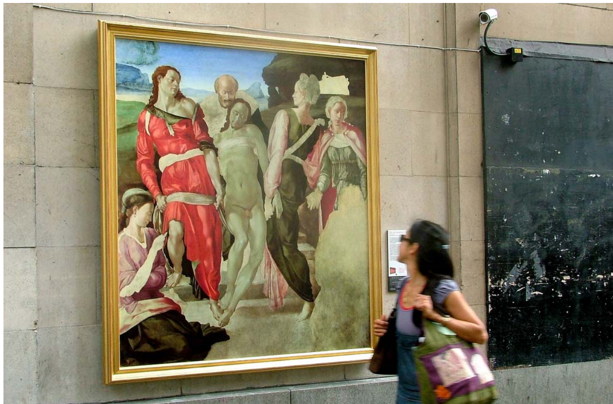
Reproduction of a Michelangelo painting on the streets of Soho, London

While Rome is further isolating its heritage, Berlin wishes to rebuild it. In the heart of the German capital construction is under way for a replica of the royal palace that was destroyed during World War II. The original palace was constructed in the 18 th century and stood next to Berlin's Dom cathedral. The so-called Stadtschloss will replace the nearly demolished Palast der Republik, the East German equivalent of a parliament building. Right across the square there are two more reconstruction projects being realized: the Bauakademie and the Alte Kommandatur (Old Army Headquarters). If things go ahead as planned, the area from the Museum Island (where most of Berlin's main public museums are located) to the Akademie will become one giant museum sphere. It is unlikely that it will manage to bring much life to the central Schlossplatz outside museum opening hours, since the area will lack the diversity of the Beaubourg in Paris or Trafalgar Square in London (Dowling, 2007).