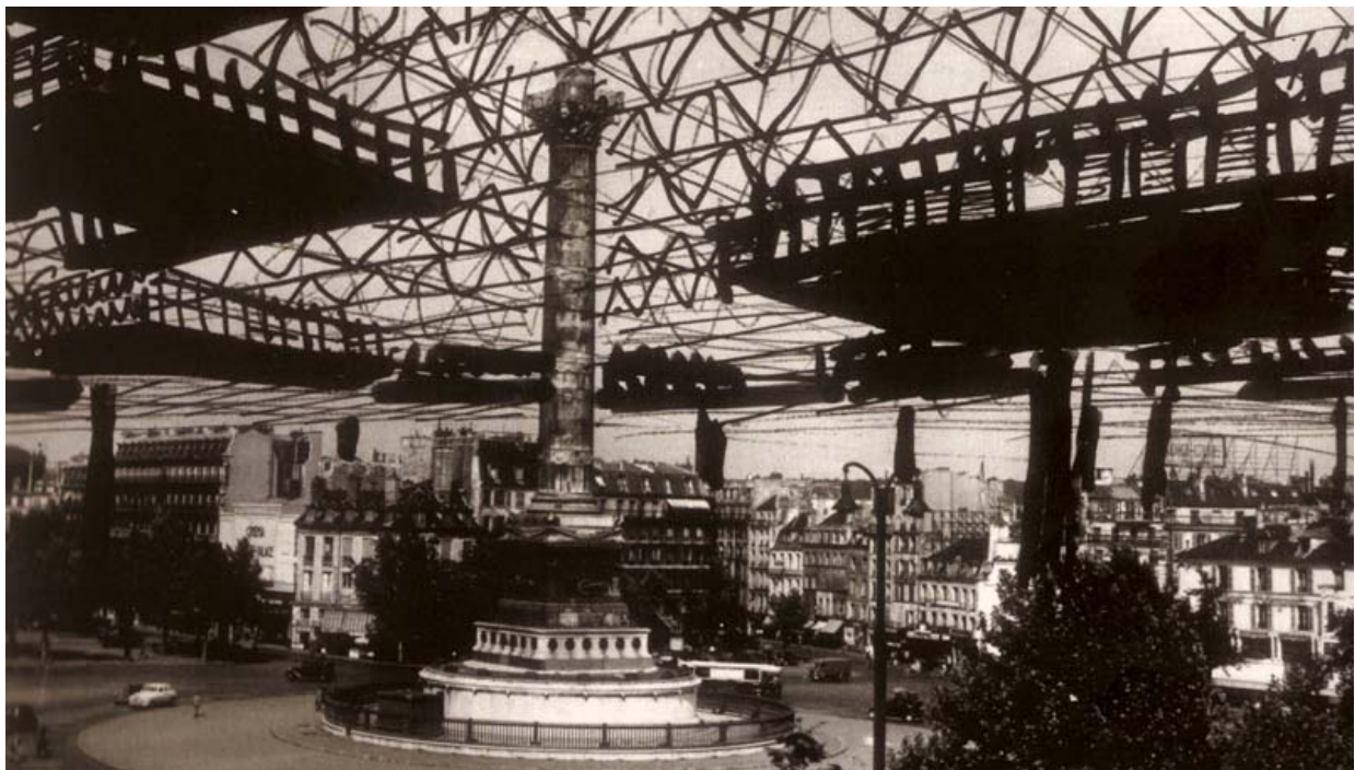
Yona Friedman, La Ville spatiale , 1960, Collage

There are other forms of 'creative destruction' that put the emphasis on the first part of the expression and leave out the destructive intentions. By (temporarily) loosening zoning laws and housing regulations, cities can create space for new initiatives. After the wall came down, Berlin experienced a renaissance of urban culture, largely because some parts of the city became a virtual no-man's-land where new things could happen. The 'Alternative Spaces Movement' in New York benefited from the same situation when small factories moved out of Soho in the 1970's, leaving a large number of historic buildings that later became known as lofts and attracted many artists. The 19 th century cast-iron buildings in Soho were subsequently discovered by more affluent residents and tourists and along with its many galleries and trendy restaurants eventually became museumized in an official historical district.