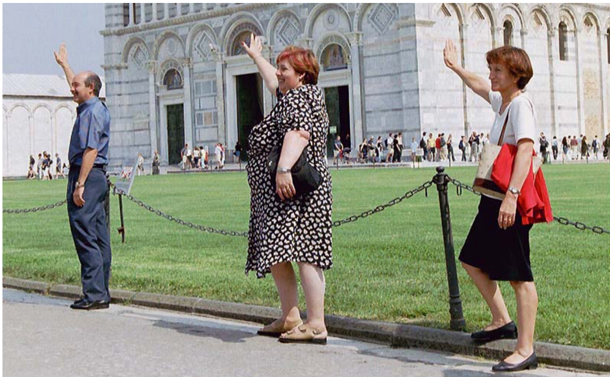
People standing in front of the leaning tower in Pisa, Italy

Especially in Europe, the old continent, numerous cities are trapped in time. Economic interests are slowly colonizing their social habitat. There has been a lot of attention in recent years for the rapidly expanding megacities in emerging countries and much has been written about the many post-industrial cities that are facing decline as they struggle to uphold their position within the international urban hierarchy. This paper wishes to emphasize the fragile position of cities that are neither growing nor shrinking, but are simply in a state of paralysis trying to turn their inertia into a unique selling point. This applies to the many cities that carry the burden of maintaining their rich heritage. In most of these cases, less lucrative activities such as dwelling and recreation are increasingly being pushed out of city centers as urban planners and city marketers work closely together in sanitizing and scripting the historic inner city. What was once a physical manifestation of the zeitgeist , is now a ghostly playground for tourists.